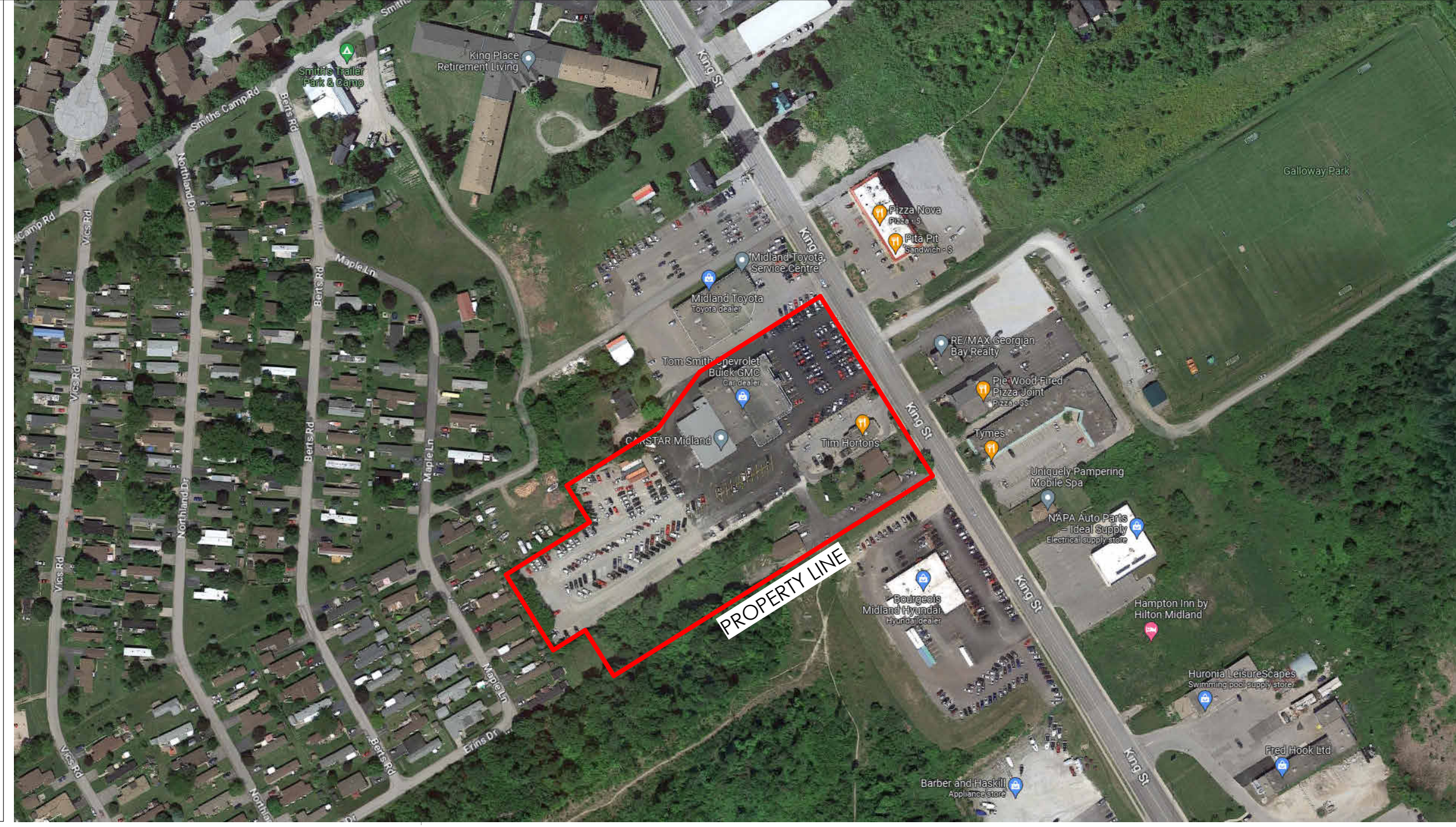
ARIAL VIEW OF SITE - 824 King St, Midland, ON L4R 4K8

824 King St, Midland, ON L4R 4K8 LOT 102 CONCESSION 1 (GEOGRAPHIC TOWNSHIP OF TAY) TOWN OF MIDLAND COUNTY OF SIMCOE BOUNDARY SURVEY: EPLEIT WOROBEC RAIKES SURVEYING LTD. 2019